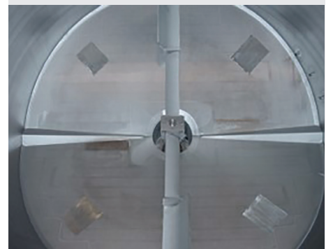
After One Cleaning Cycle

Visit birkocorp.com for more information on CIP solutions